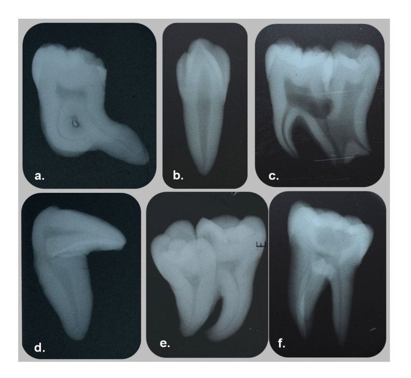
Figure 2 - Radiograph of dental anomalies. (a. Root dilaceration of mandibular molar; b. Talons' cusp lined by enamel containing core of dentin and pulp in maxillary lateral incisor; c. Fusion of root between mandibular second and third molar; d. Crown dilaceration of maxillary central incisor; e. Concrescence between mandibular first and second molar with dens evaginatus; f. Enamel pearl seen as radio-opaque foci near the furcation area)

Understanding the etiology of each dental anomaly is important not only in identification but also to determine the course of the treatment. So, we aim to review the literature regarding various anomalies affecting the tooth and the criteria laid down for its diagnosis.