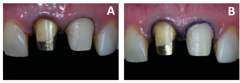
FIGURES 3 – A) First (#000) and B) second (#0) retraction cord inserted into the gingival sulcus.

One month later, the patient returned for the impression step. The soft tissue was displaced using the double cord technique (#000 and #0 Ultrapak cord; Ultradent, Idaiatuba, SP, Brazil) (Figures 3A and 3B), and a full-arch impression was performed with polyvinyl siloxane (Express XT Putty and Light Body; 3M Espe, St. Paul, MN, USA) using a double-mix technique. An opposing arch impression was also taken using irreversible hydrocolloid (Cavex ColorChange; Cavex, Haalen, Netherlands). Color selection was conducted using digital images and a shade guide (Vitapan Classic; Vita-Zahnfabrik, Bad Sackingen, Germany). The left central incisor matched shade B2 (cervical) and B1 (incisal edge), and the right central incisor matched shade B4 (Figures 4A and 4B).