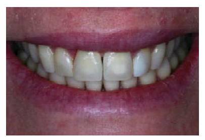
FIGURE 1 - Initial frontal smile view.

teeth (Trilux; VIPI Produtos Odontológicos, Pirassununga, São Paulo, SP, Brazil) and self-cured acrylic resin (Dencôr; Clássico, Campo Limpo Paulista, SP, Brazil), providing both function and aesthetics.