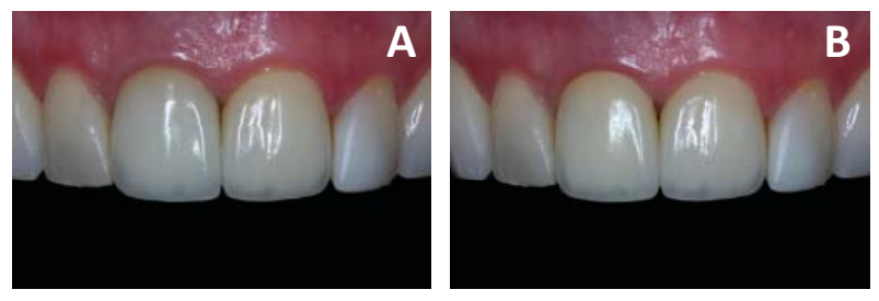
FIGURES 5 – Comparison of frontal view photos. A) The initial view with lithium disilicate crowns, on both central incisors, and B) the final view with the zirconia crown on the right central incisor.